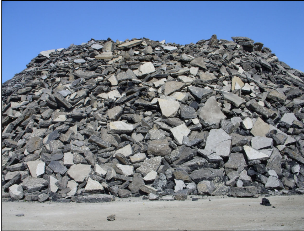
Figure 5. Example of a clean stockpile of recycled HMA.