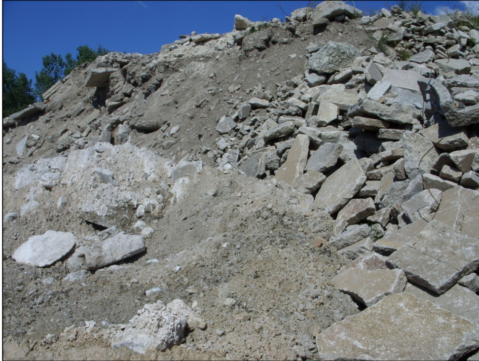
Figure 3. Recycled stockpile with excessive fines.