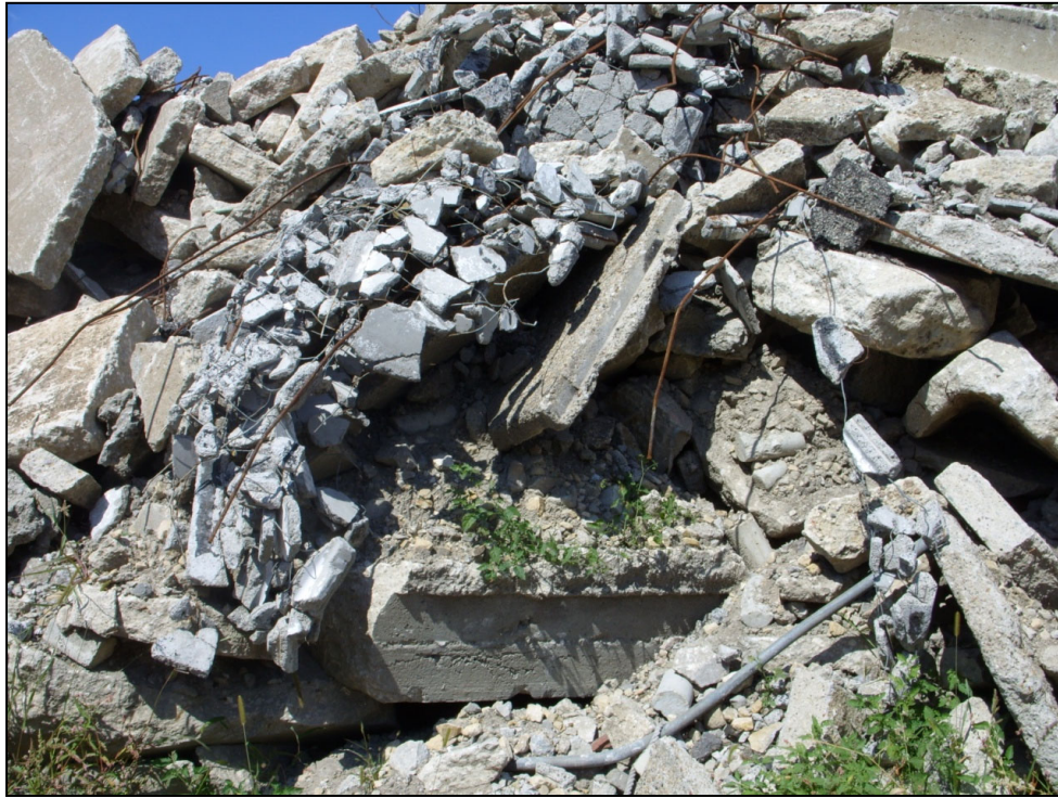
Figure 1. Recycled stockpile contaminated with steel.