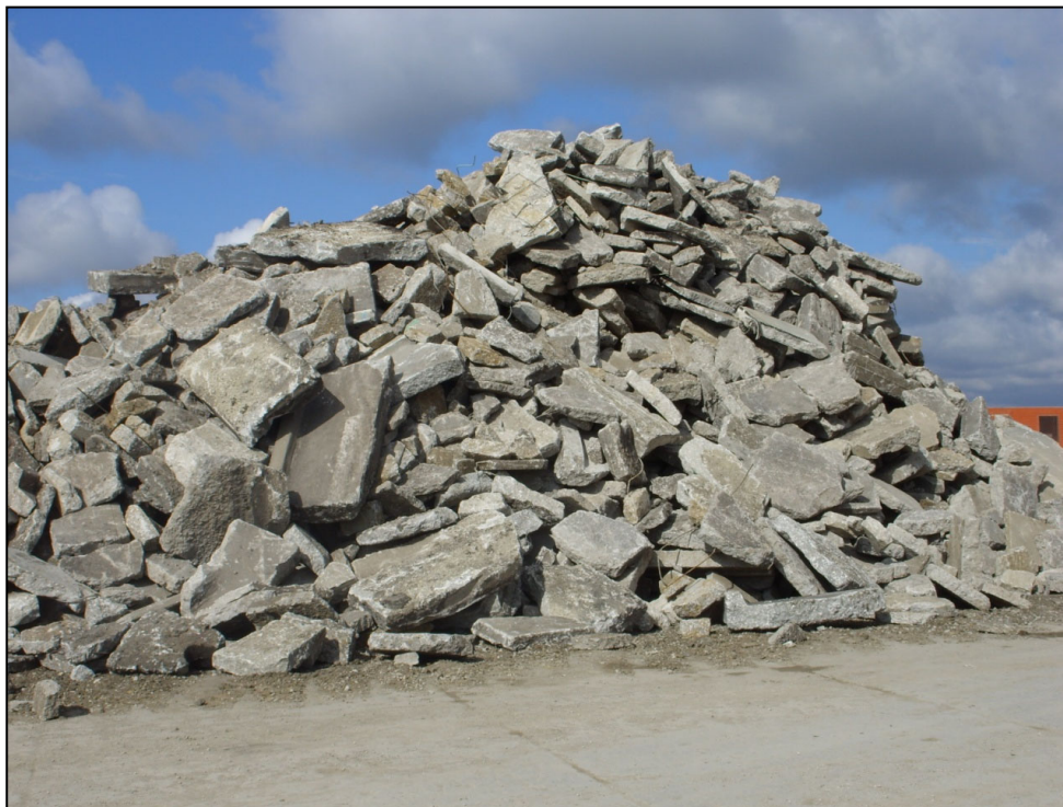
Figure 6. Example of a clean stockpile of recycled PCC.