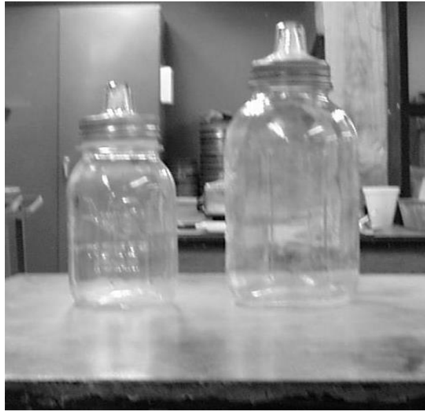
Pycnometers for Coarse and Fine Aggregates