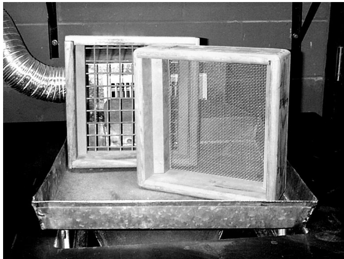
Figure 1. Box Sieves for testing coarse aggregates.

A set of 12 in. Diameter Sieves may be used for testing fine aggregate, coarse aggregate or aggregate containing both coarse and fine material.