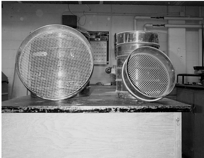
Figure 2. 12 and 8 in. sieves.