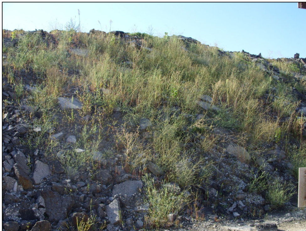
Figure 2. Recycled stockpile contaminated with organic material.