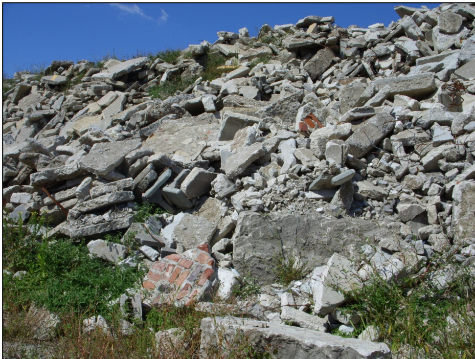
Figure 4. Recycled stockpile contaminated with non-pavement material.