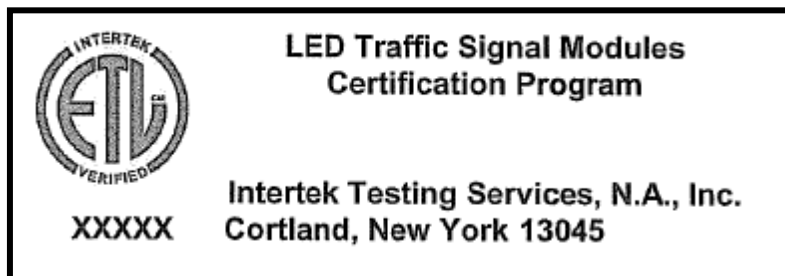
Figure 4. Intertek- ETL Verified Label

For firms with business and/or corporate citizenship in the United States of less than seven years, the process by which the end-users/owners of the modules will be able to obtain worst-case, catastrophic warranty service in the event of bankruptcy or cessation-of-operations by the firm supplying the modules within North America, or in the event of bankruptcy or cessation-of-operations by the owner of the factory of origin, shall be clearly disclosed.