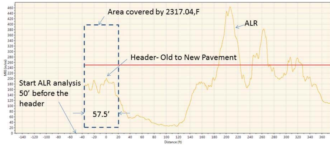
Figure 1. Area of Localized Roughness (ALR) Analysis at the Beginning of Project (Same at End of Project)

Note: The ALR at any point covers profile 12.5' back and 12.5' forward.