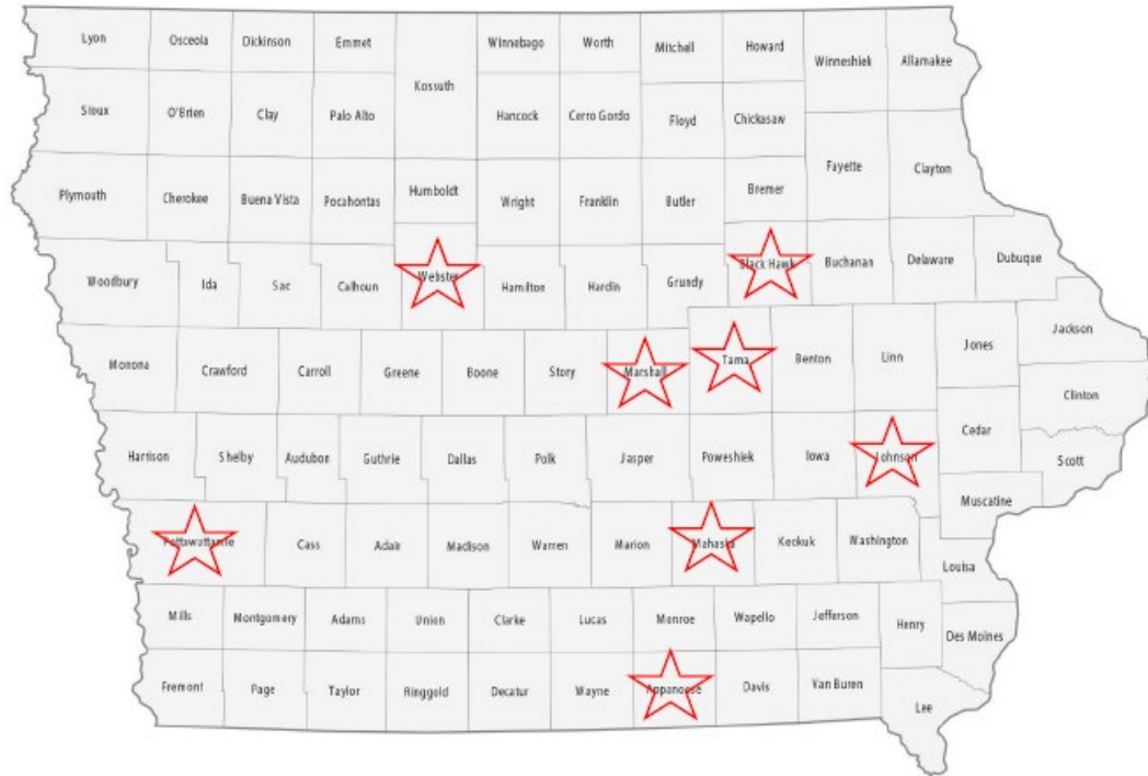
Iowa Off-Highway Vehicle Parks

Return to List of Applications Recommended