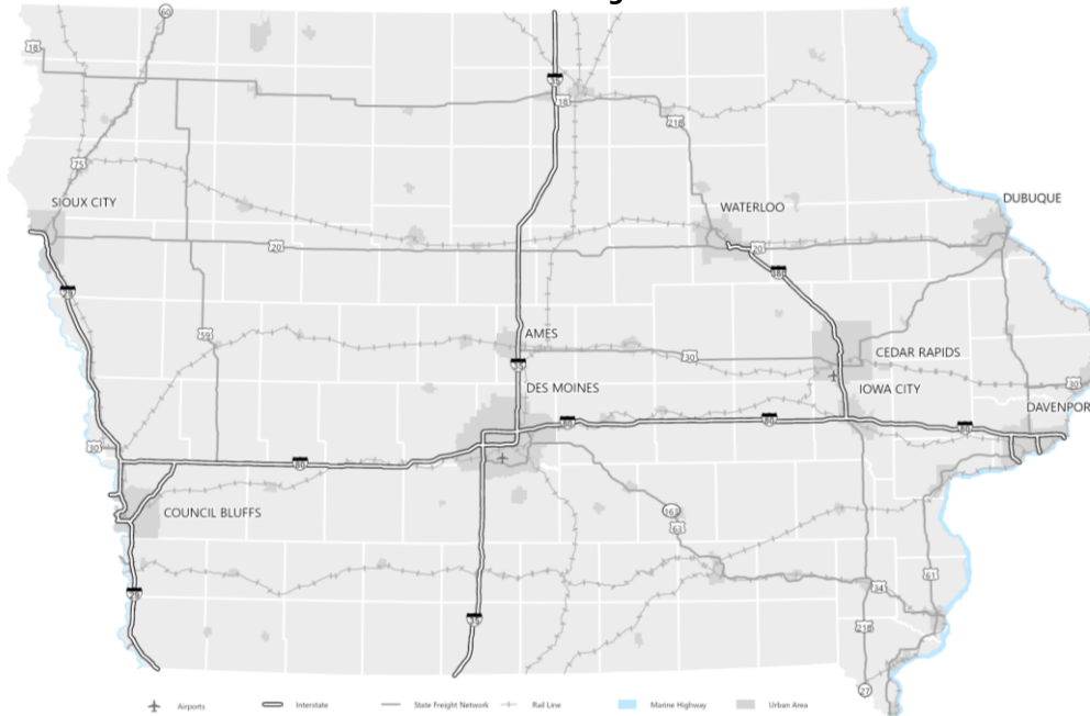
Iowa Multimodal Freight Network