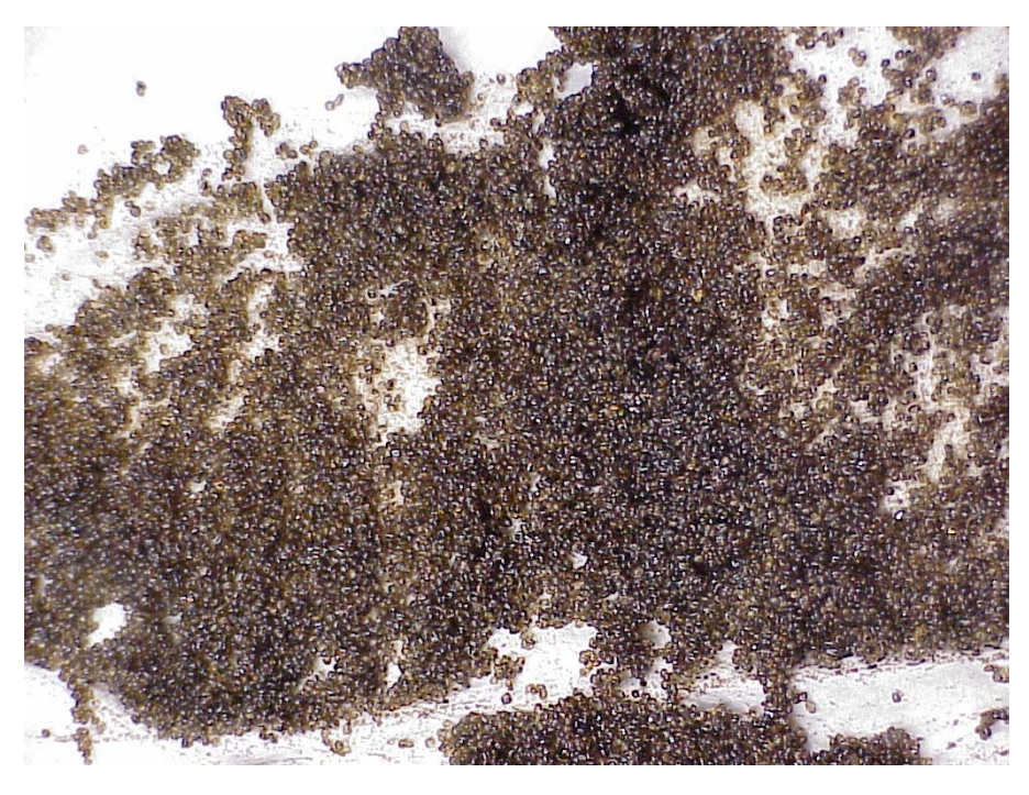
Homogenous Mix (Results Positive)