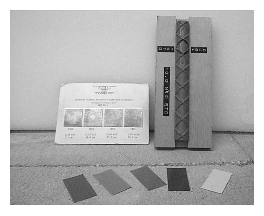
Figure 2. Calibration Standards