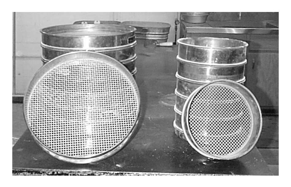
Figure 2. Fine Sieves