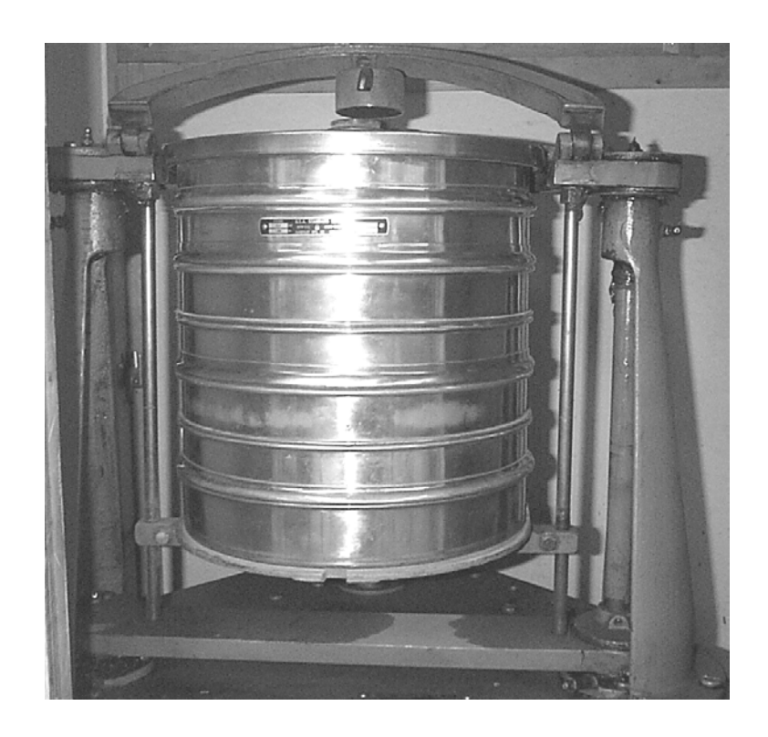
Figure 4. Coarse Sieves Mounted in "Ro-Tap" Shaker